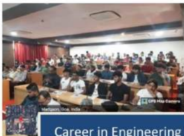
Career in Engineering