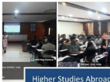
Higher Studies Abroad