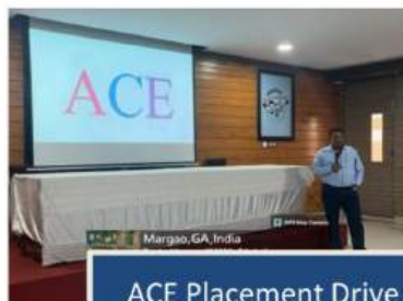
ACE Placement Drive