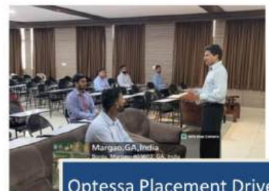
Optessa Placement Drive