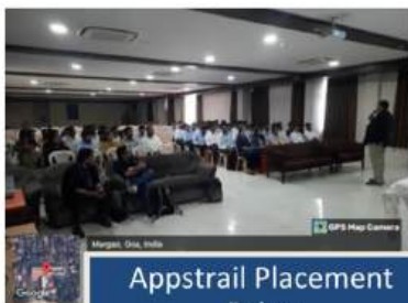
Appstrail Placement Drive