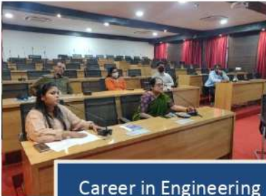
Career in Engineering