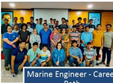
Marine Engineer - Career Path