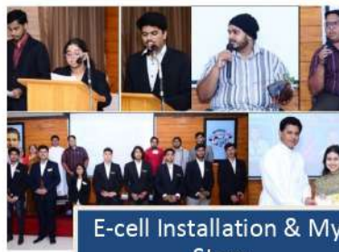
E-cell Installation & My-Story