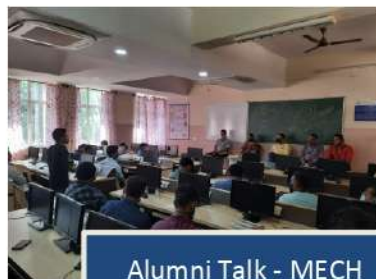
Alumni Talk - MECH