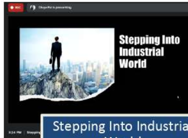
Stepping Into Industrial World