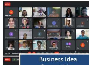
Business Idea Competition