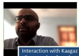
Interaction with Kaagaz Scanner App founder