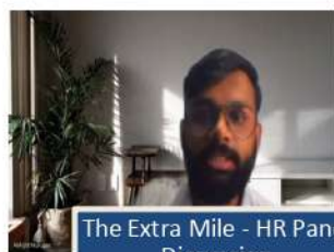
The Extra Mile - HR Panel Discussion