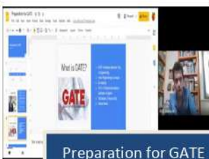
Preparation for GATE