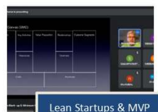
Lean Startups & MVP